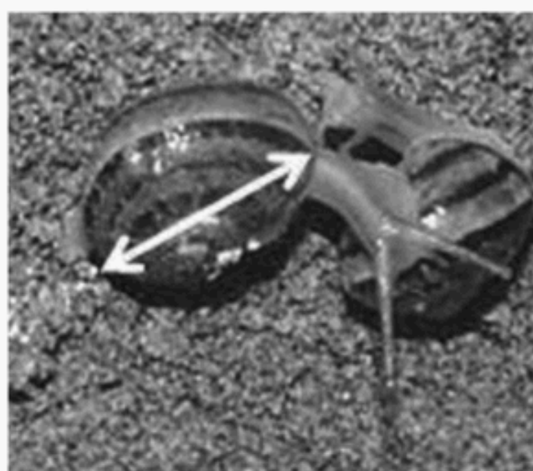
Figure 1 — Measure of the shell diameter, i.e. the longest size that can be measured (white arrow on the photo)

The mass of the snails may be uncertain if they have test substrate on their shell or their foot. Before each weighing, using a spatula, remove the substrate from the shell or the foot. It is possible to leave the snails to move about on the clean container lid or on slightly moist paper so that they get rid of the substrate adhering to their foot.