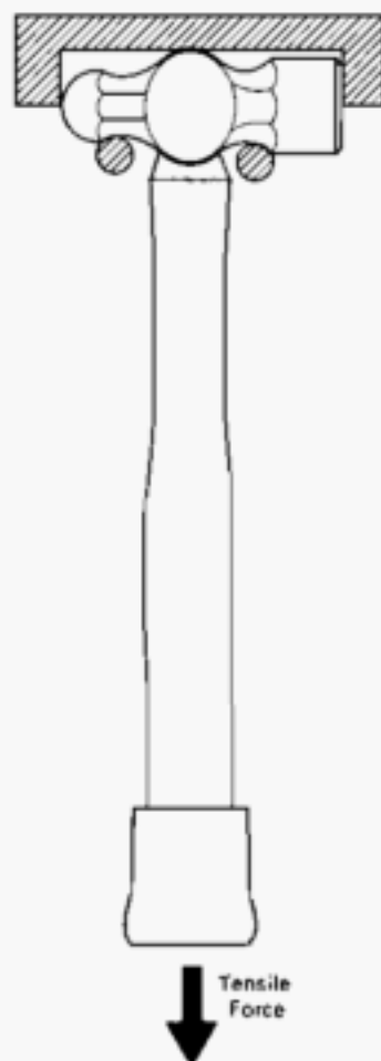
Fig. 2 Typical Tensile Force Test

(a) The tool shall withstand 20 swinging blows on the striking face and 20 swinging blows on the ball peen end at a head velocity of 45 ft/sec to 55 ft/sec (approximated by a person of average build, 160 lb to